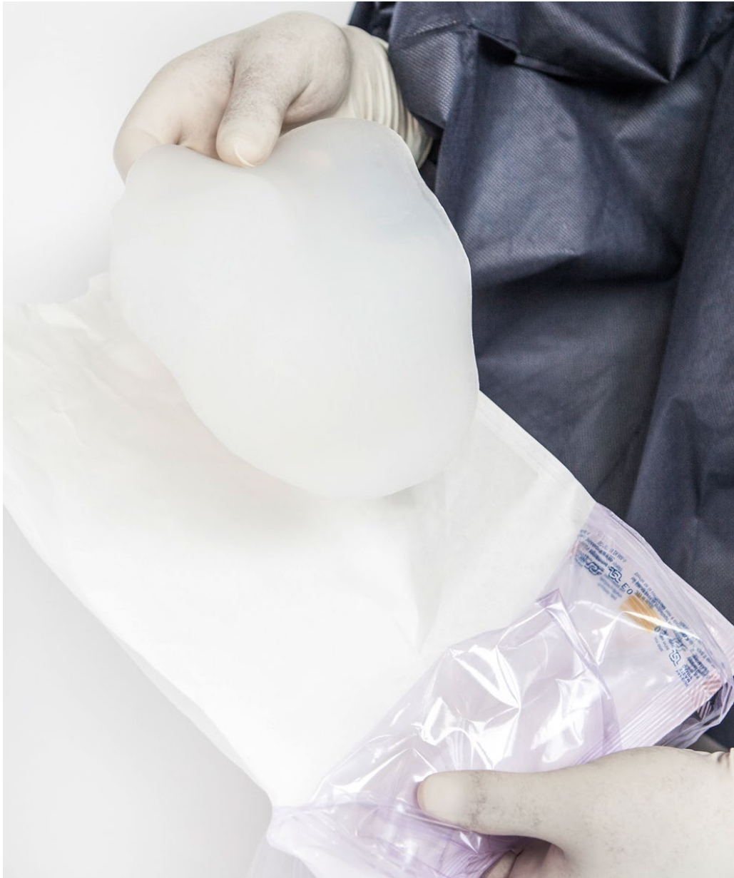
Medical-grade silicone elastomer sterile implant