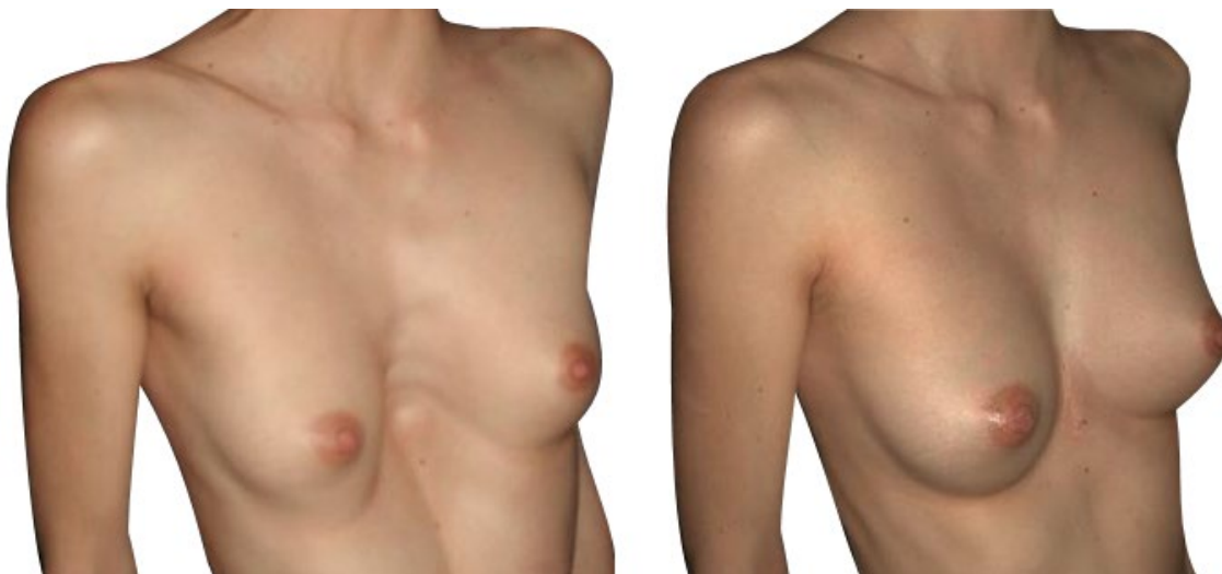
Before/After surgery in a woman