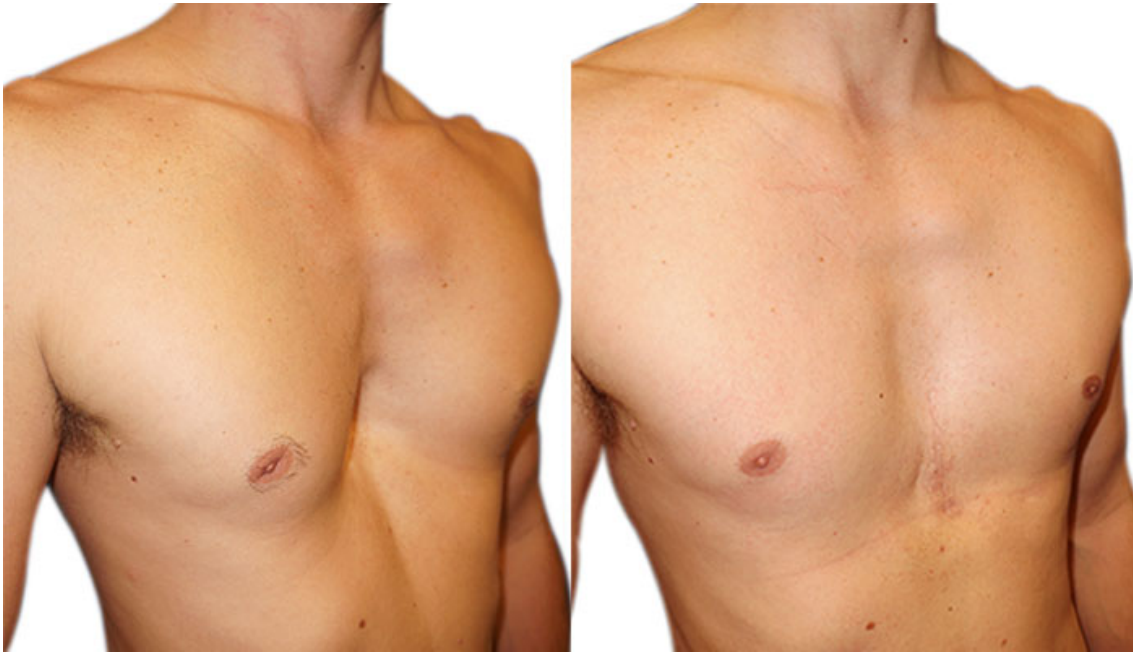
Before/After surgery in a man

Correcting the deformity is in a vast majority of cases complete, definitive, and natural with a very satisfying anatomical restauration.